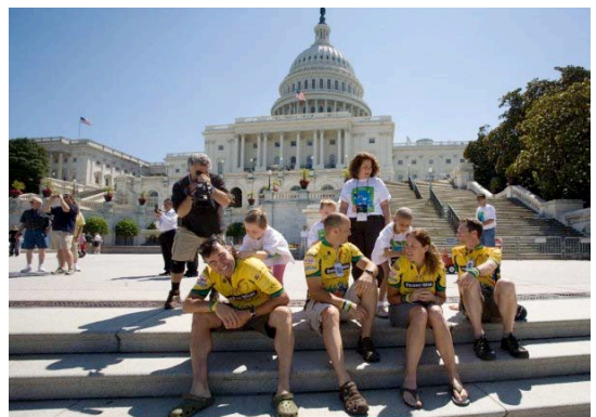
Washington, D.C. Team Will Cyclists on U.S. Capital steps